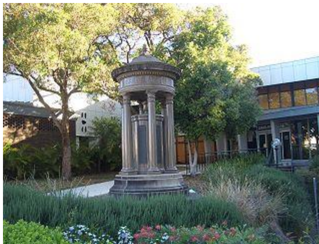
Drummoyne War Memorial