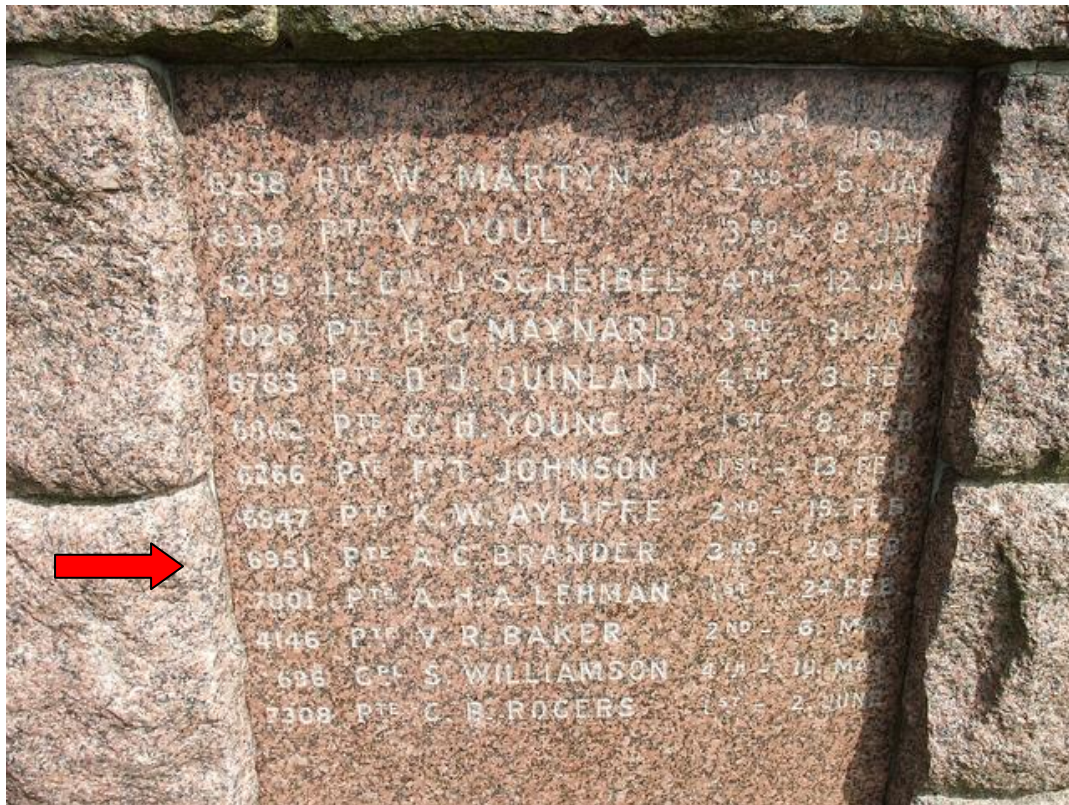
Memorial to 1 st Training Battalion A.I.F. at Durrington Cemetery